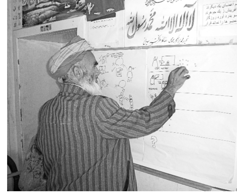
An Afghan father voting for his favourite aspect of the SCA's work with his child

What struck me most when working with the parents was that people are people, wherever you are. Unlike what we are told, they are warm and hospitable people. Just like parents of disabled children in the UK, they all care and worry about their children, all face daily challenges and all want their child to live happily in the local community.