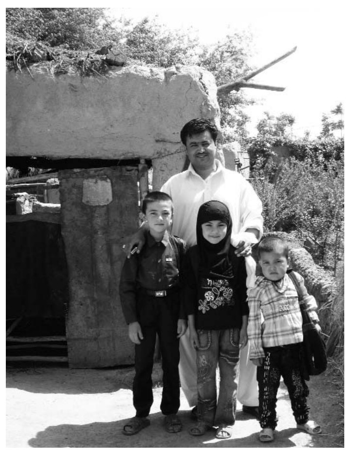
An SCA worker on his weekly visit to three siblings to teach them sign language and writing

I met a number of children whose lives had been transformed by the project. Having driven past